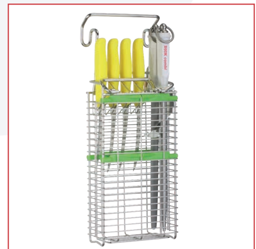
ITEC knife holder type 22240