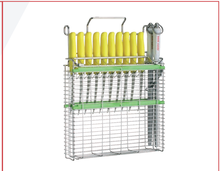
ITEC knife holder type 22200