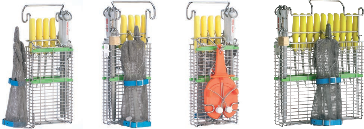
ITEC knife holder type 22240/22200